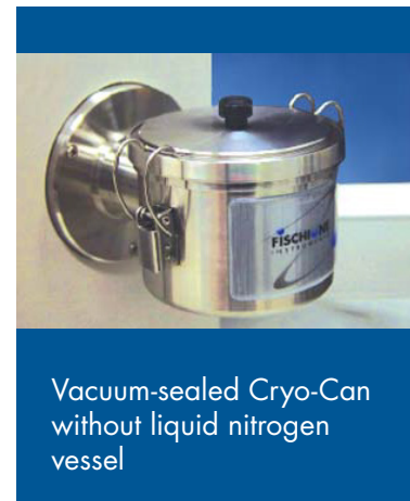
Vacuum-sealed Cryo-Can without liquid nitrogen vessel