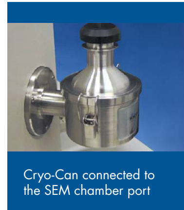
Cryo-Can connected to the SEM chamber port

Other than maintaining the integrity and cleanliness of the O-ring seals, no maintenance of the Cryo-Can is required.